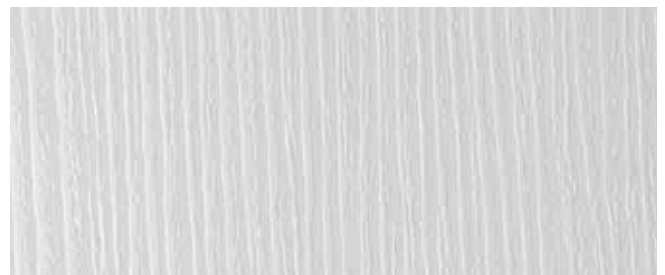
RT Rustic Touch RU Rustica